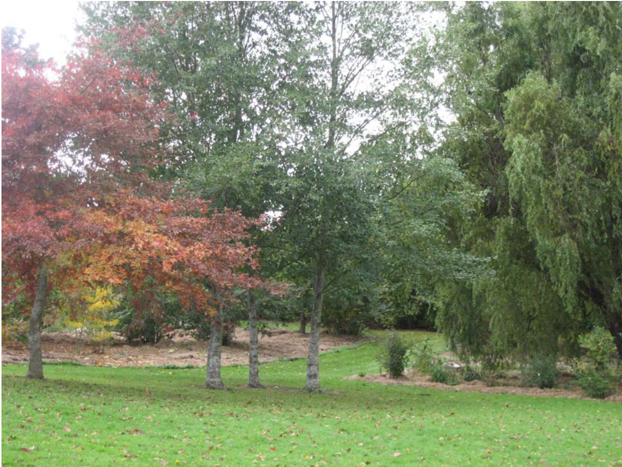
Tara Farm homestead garden