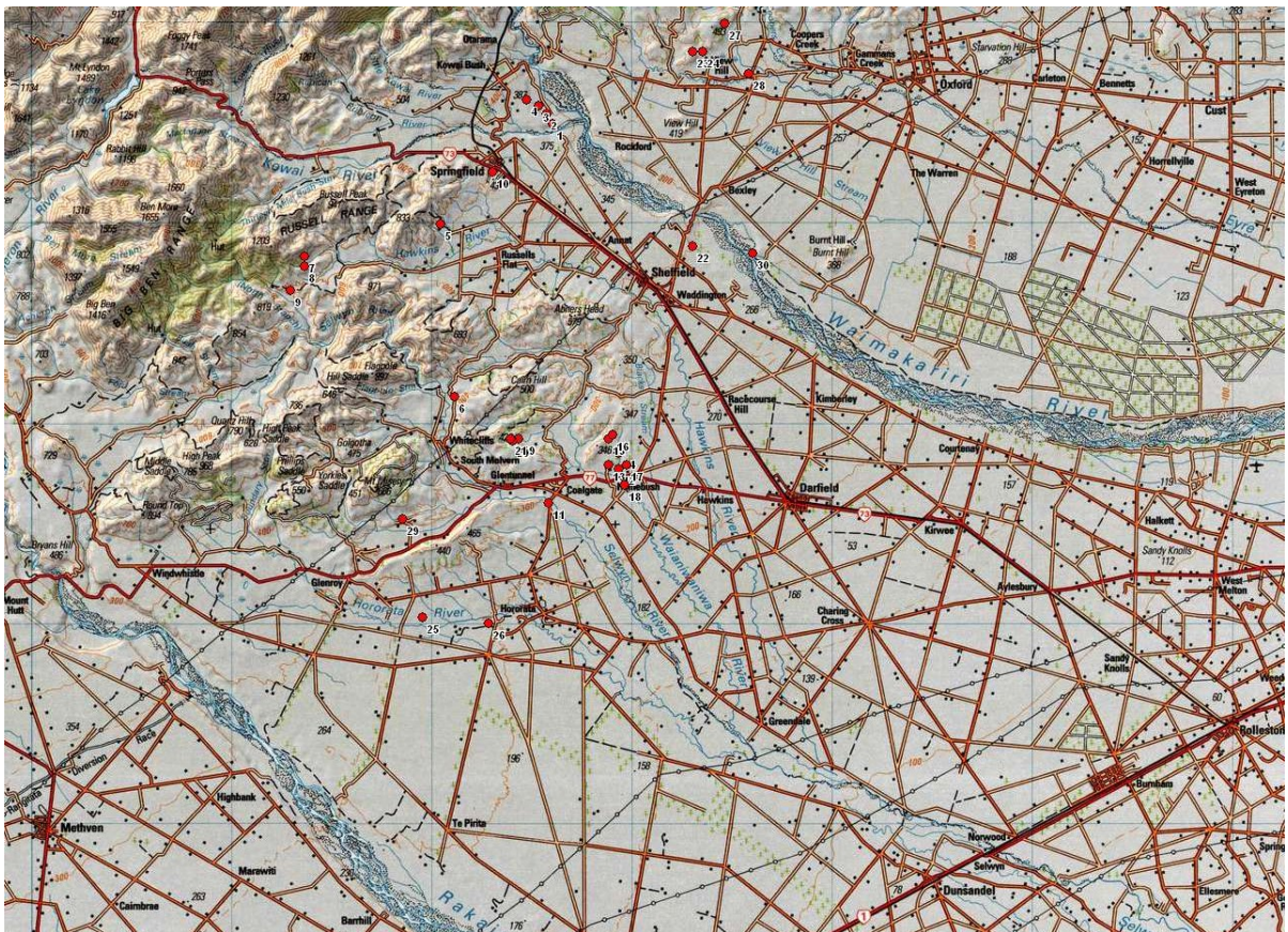
Figure Two: Extent of some of the recorded archaeological sites within the area of proposed development

20. Under the Historic Places Act 1993 (HPA) archaeological sites are defined as any place associated with human activity prior to 1900, where evidence relating to the history of New Zealand can be investigated using archaeological methods. Wherever possible, the destruction, damage or modification of archaeological sites should be avoided or minimised. In our submissions we requested the applicant undertake an archaeological assessment to determine the archaeological values of the area, given there are a number of recorded archaeological sites within the area of the proposed irrigation scheme. See topographical map below showing the extent of some of the recorded archaeological sites. Under the HPA it is unlawful to alter, modify or destroy an archaeological site without an archaeological authority from NZHPT to do so.