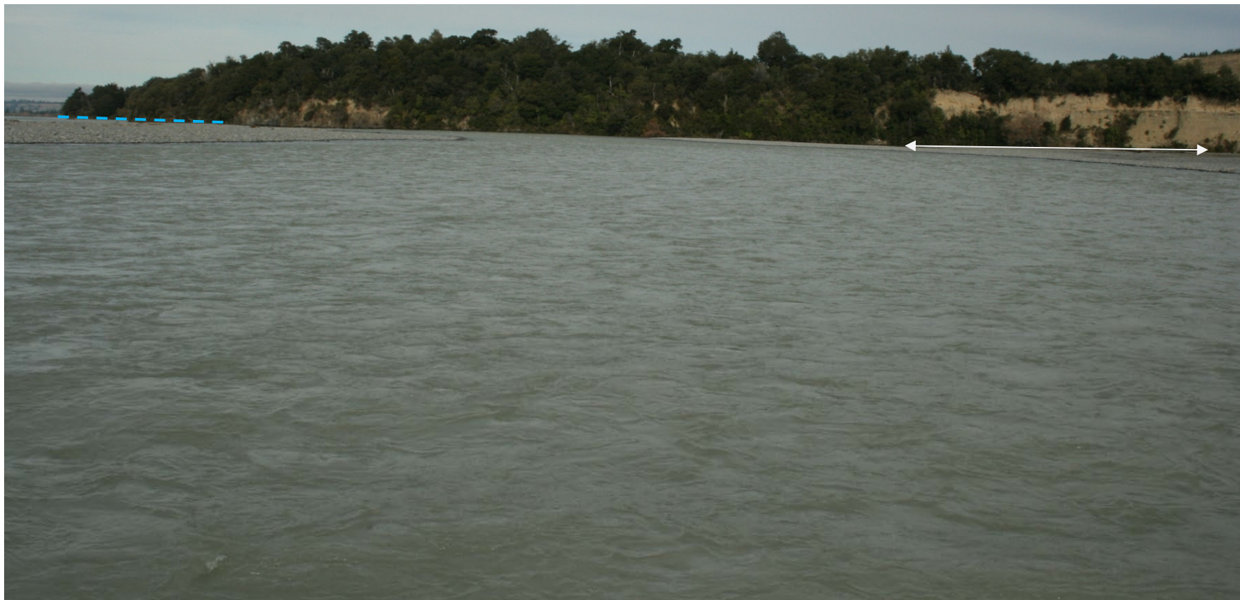
Photograph 4: Showing the same bluff from further upstream. The white arrow indicates suitable intake site. The blue dashed line indicates approximate position of intake canal upstream of applicant's photo-simulation site PPT 2a.