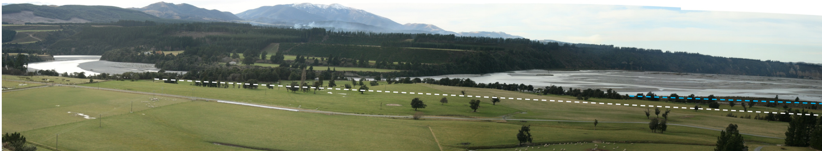
Photograph 1: From Taege property looking north to mid and upstream Waimakariri River in the vicinity of the proposed upper intake (more or less following alignment of blue dashed line). This landscape displays a very high level of natural character in association with the river. The preferred option would entail a tunnel intake beneath the foreground paddocks as indicated by the white dotted line, emerging on the river flats downstream. This would have the least disturbance on the landscape as seen above and in the photograph below.