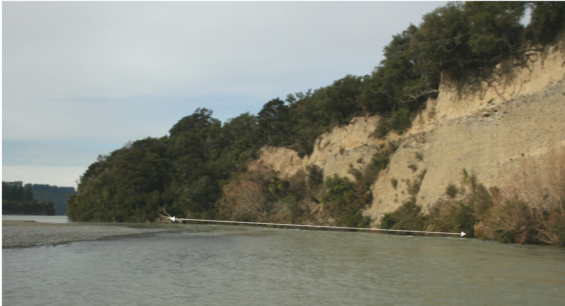
Photograph 3: Showing upper Waimakariri bluff where, from a landscape effects point of view, the better position of possible tunnel intake – within the confines of the white arrow.