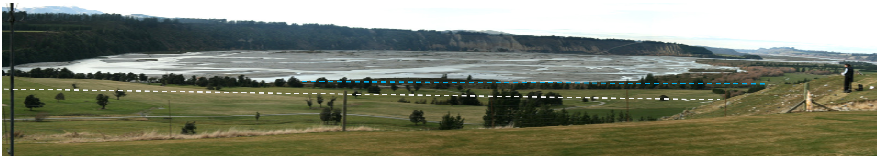
Photograph 2: From in front of the Taege residence the view downstream shows the high level of naturalness associated with the river. The more the intake structures can avoid the active bed of the river the better with a view to maintaining the natural character and amenity of this setting. The upper intake canal as proposed by the applicant would significantly jeopardise this where it appears to intrude upon the sensitive river margin.