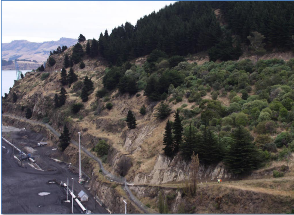
Photo 5. LPC plantings from 1960s and 1970s, above Te Awaparahi Bay coal yard.