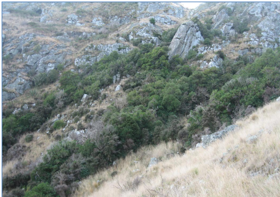
Photo 2. Regenerating mixed hardwood forest/shrubland amongst bluffs above the proposed quarry footprint.