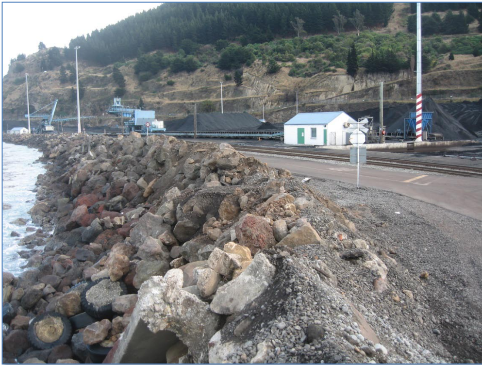
Photo 6. Coal yard at Te Awaparahi Bay, with seawall on left.