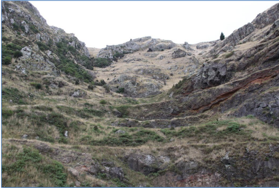
Photo 1. Existing quarry in foreground, with steep slopes and bluffs above.