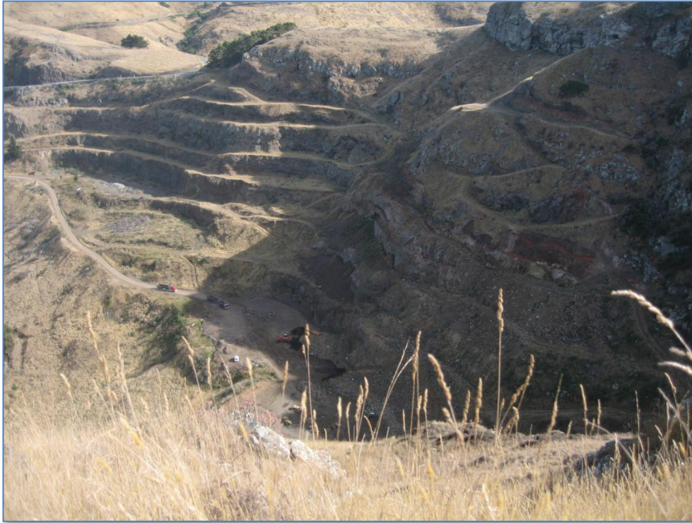
Photo 3. Existing quarry, looking toward Evan's Pass (upper left).