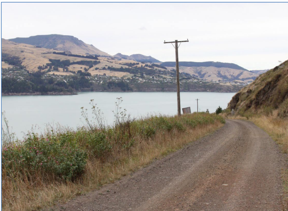
Photo 4. Existing haul road. Note dominance of exotic vegetation.