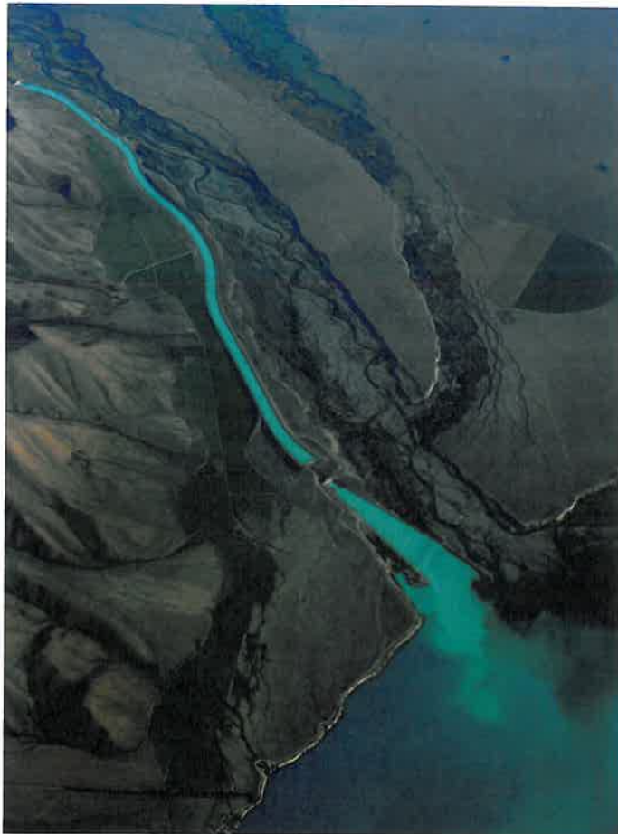
Figure 2 Aerial photograph showing the distinct inflows from the the Ohau C Canal, lower Ohau River and Tekapo-Pukaki River (Plate 1 from the Addendum to evidence of Donna Sutherland dated 30 th November 2009)