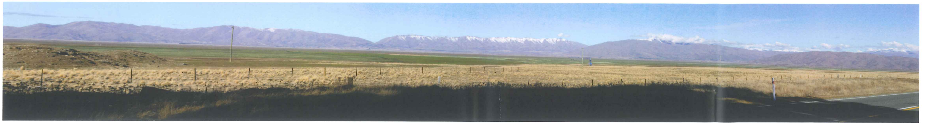
Photomontage 1 Showing pivot irrigation perpendicular to State Highway 8 (from which the photograph was taken). Prepared by Andrew Craig Landscape Architect