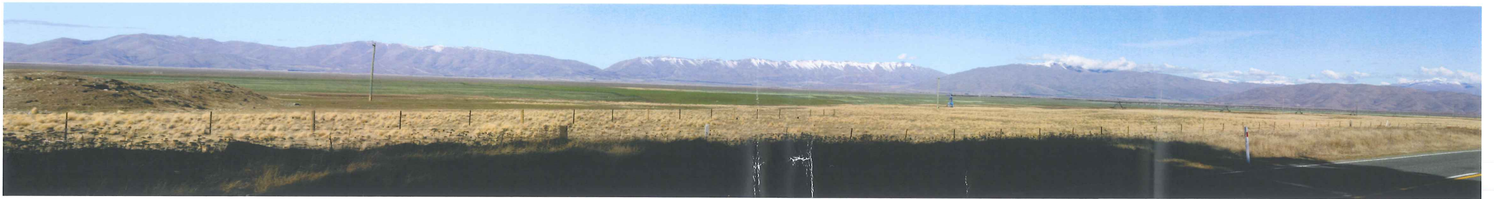
Photomontage 2 Showing pivot irrigation running parallel to State Highway 8 (from which the photograph was taken). Prepared by Andrew Craig Landscape Architect