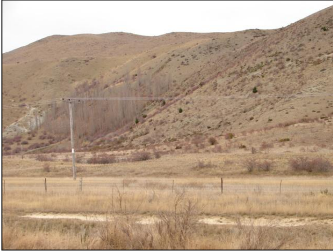
Area to be irrigated – Lake Waitaki