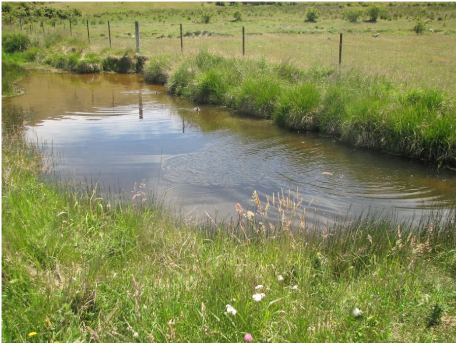
Holding area for water immediately downstream of where the race enters the property