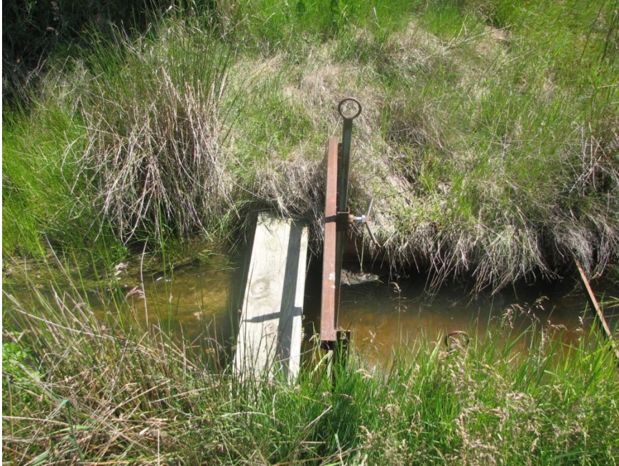
Where water enters the property from the Sutherlands