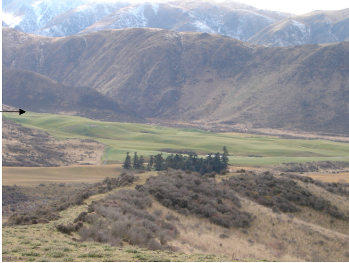
Black Jack Stream looking down stream