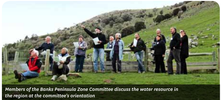
Members of the Banks Peninsula Zone Committee discuss the water resource in the region at the committee's orientation

The Banks Peninsula Zone Committee is a joint committee of Environment Canterbury and Christchurch City Council. The appropriate Rūnanga are also represented.