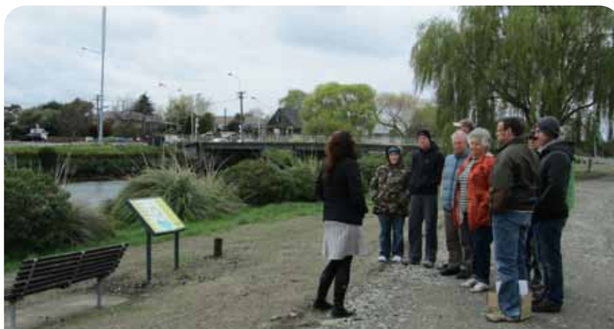
Members of the Christchurch - West Melton Zone Committee learn about the Avon River/Ōtakaro as part of an orientation field trip.

The Christchurch-West Melton zone committee is a joint committee of Environment Canterbury, Christchurch City Council and the Selwyn District Council.