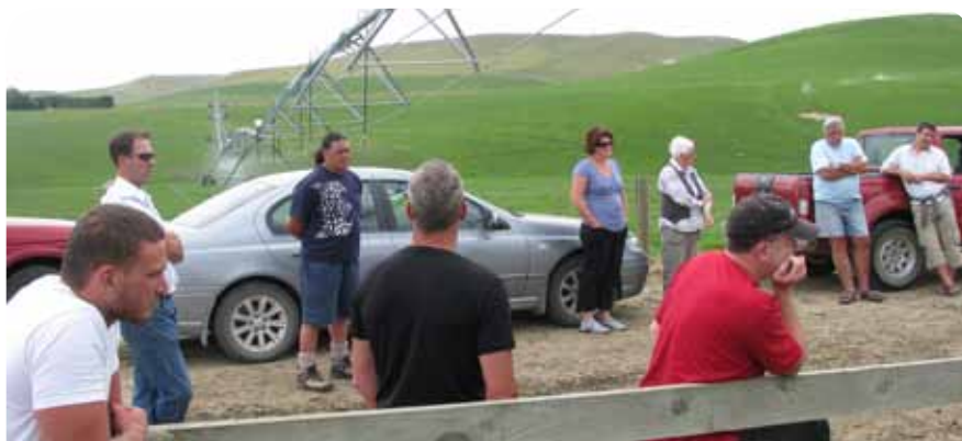
The Lower Waitaki Zone Committee visits a local farm to learn about successful effluent management, water use efficiency and the protection and restoration of wetlands

The zone extends from the Otaio catchment in the north, to the Waitaki Dam in the south. It takes in Waimate, Kurow and Duntroon.