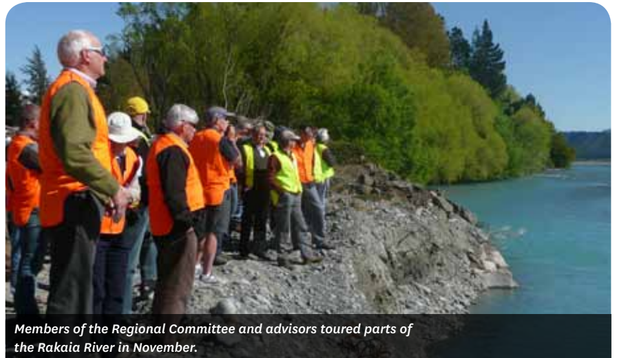
Members of the Regional Committee and advisors toured parts of the Rakaia River in November.

It operates as a committee of Environment Canterbury under the Local Government Act.