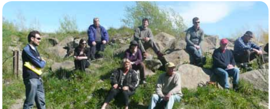
Waimakariri Zone Committee on the banks of the Ashley/Rakahuri river as part of their orientation field trip

The Waimakariri Zone includes the Ashley River catchment and shares the Waimakariri catchment below the gorge with the Selwyn-Waihora and Christchurch-West Melton zones. It includes Kaiapoi, Rangiora and Oxford.