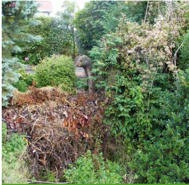
Green waste, dumped over a bank close to waterway. Note: Old Man's Beard growing and seeding in the right foreground. It probably became established from illegal garden dumping.

Unbelievable as it might seem, there are people who choose some of Canterbury's more secluded areas to dispose of excess green waste from their gardens. Presumably they think it'll rot down harmlessly and that's an end to it. Unfortunately they are wrong.