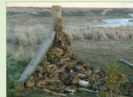
Live rabbits trying to get over a rabbit-proof fence.

The inspection process throughout the Ashburton plains, where we have no transects, indicates low rabbit levels. Landowner-initiated control, most probably on a recreational basis, change in farm land use to dairy and RHD epidemics are still combining effectively to curb any population increase at this stage.