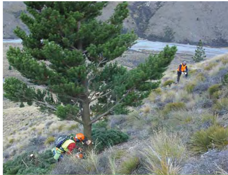
Chain-sawing of mature pine. The wilding pine control project requires specialist contractors.

Control work is strategic and concentrates on mature coning trees first as a potential source of further spread. This will sometimes leave scattered immature trees in the same area. These are of a lesser priority and will be controlled at a later stage. By selecting target trees in this way, seed is less likely to reach new or previously controlled sites.