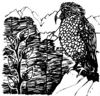
mountain beech-kea- moist mountain ranges

The high rainfall Main Divide, with adjoining moist mountains that span the length of the region e.g. Glynn Wye, Craigieburn and Ben Ohau Ranges.