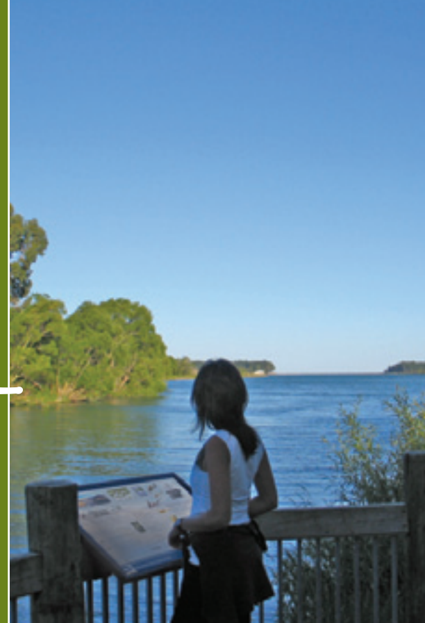
Waimakariri River Regional Park