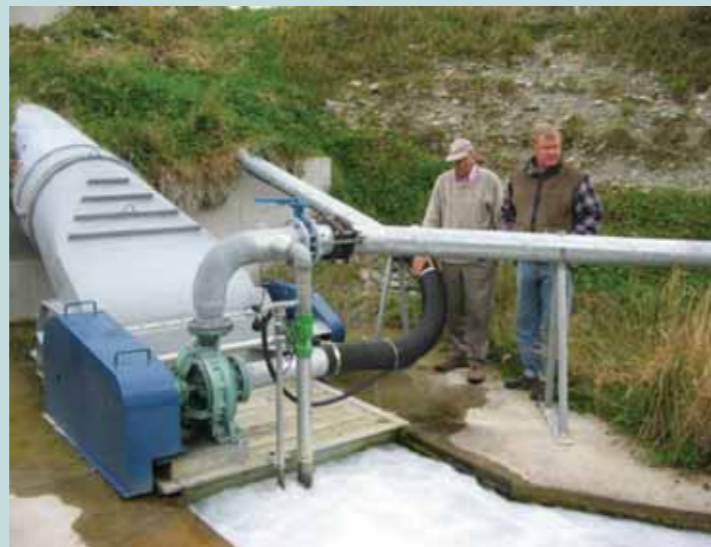
Waitaki River Power Generator at Bells Pond.

For more information relating to consents in the Waitaki catchment, please contact customer services at Environment Canterbury on 03 371 4909. For more general information, call 0800 EC INFO. (0800 324636).