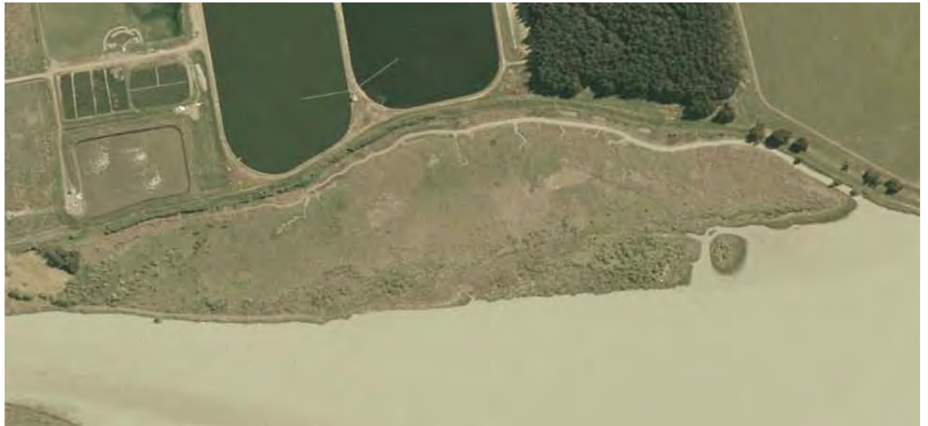
Aerial view of the tidal saltmarsh and freshwater wetland