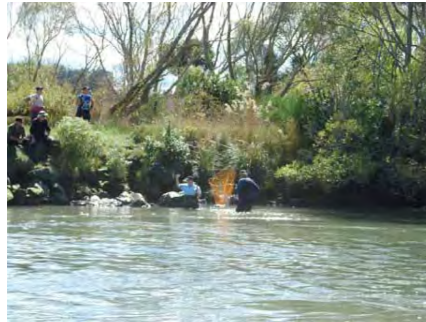
Salmon Anglers at McIntosh's Rocks

There is a walkway pursuant to the Walkways Act 1975 that runs between Askeaton Reserve Kaiapoi, and Beach Road on the western bank of Saltwater Creek, leading to The Pines and Kairaki Beaches.