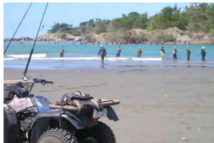
Salmon anglers line both sides of the river mouth