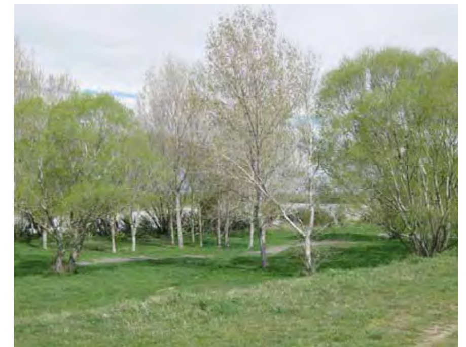
McIntosh picnic area