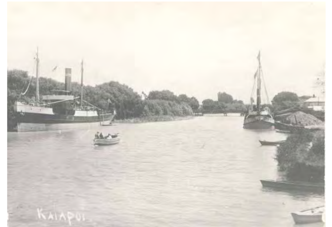
Kaiapoi Port, circa 1911. “S.S. Kairaki” on the left