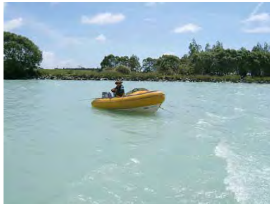
Fishing at McIntosh's Hole