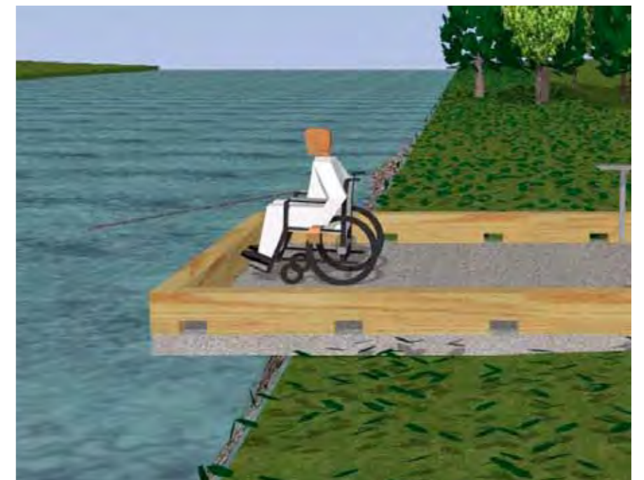
NZ Salmon Anglers Association proposed fishing platform