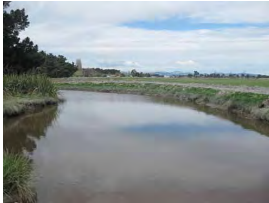
Saltwater Creek - looking downstream from the Beach Road floodgates

The margins of Saltwater Creek between the Beach Road floodgates and Waimakariri River are largely devoid of native vegetation at present, but could offer suitable habitat for restoration planting of native saltmarsh species such as three square, sea rush and marsh ribbonwood.