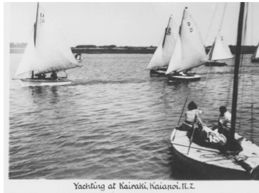
Yachting at Kairaki, circa 1947

There will likely be commercial recreation and leisure operators at Kaiapoi and Kairaki which will support the activities occurring within the lower reaches of the park.