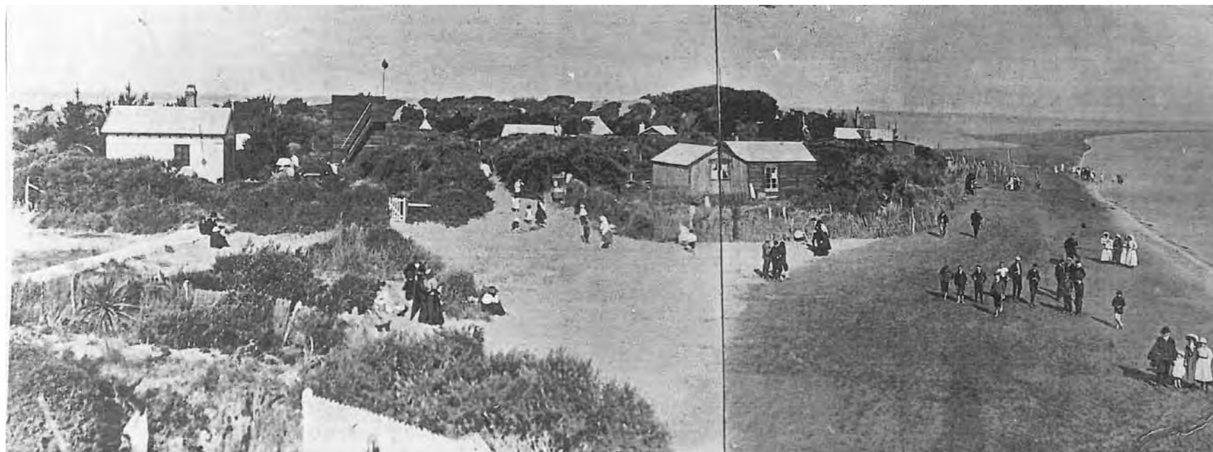
Kairaki circa 1910

Today, the lower reaches of the Waimakariri River are highly modified and bear little resemblance to how they looked 150 years ago.