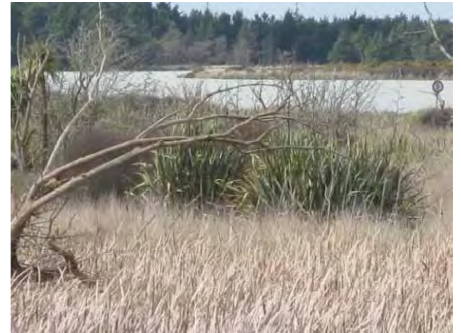
Jockey Baker freshwater wetland