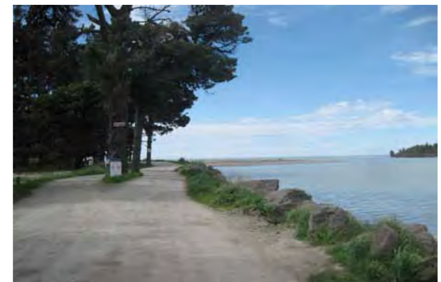
Kairaki stopbank entrance to the river mouth and Pegasus Bay