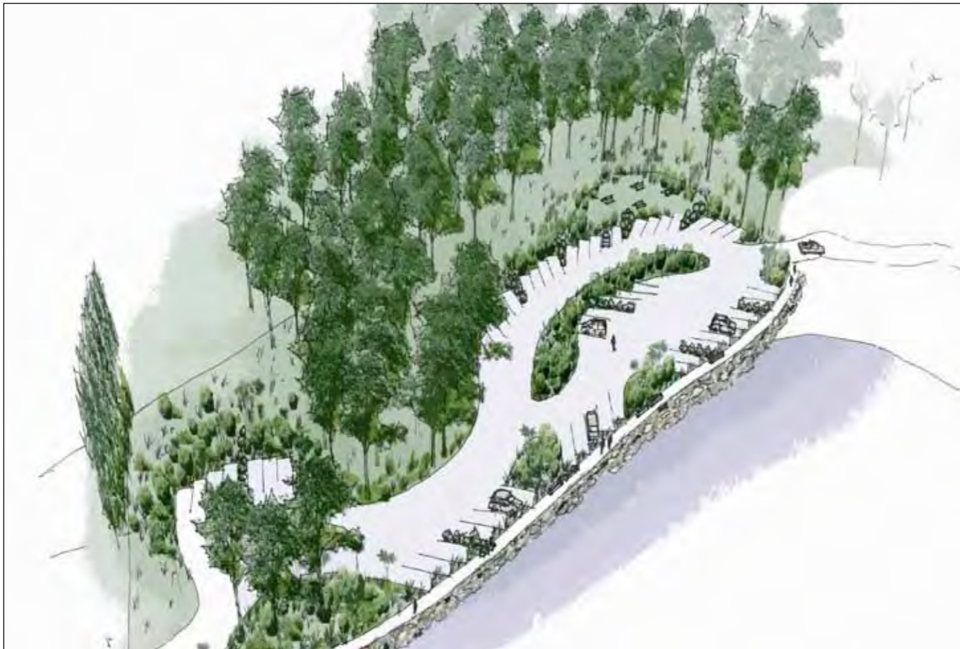
Artists impression of the proposed Kairaki carpark and entrance to the river mouth and Pegasus Bay