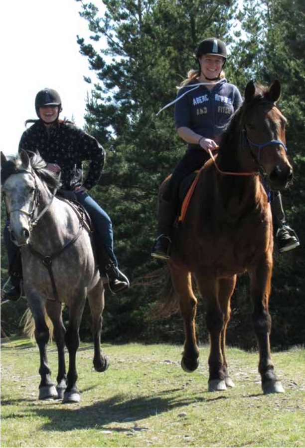
Waimakariri River Regional Park