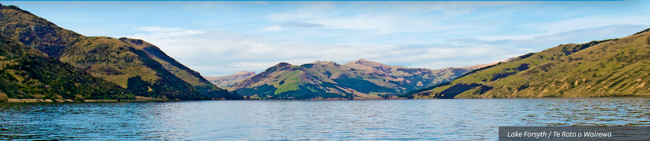
Lake Forsyth / Te Roto o Wairewa