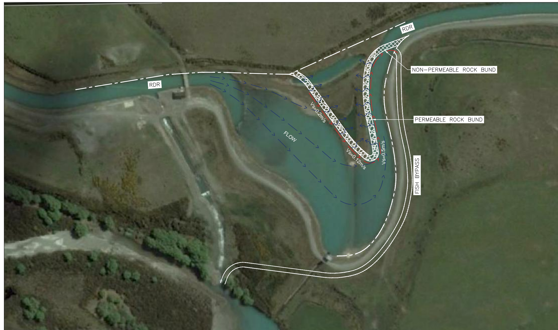
FISH SCREEN LOCATION PLAN SCALE 1:2000