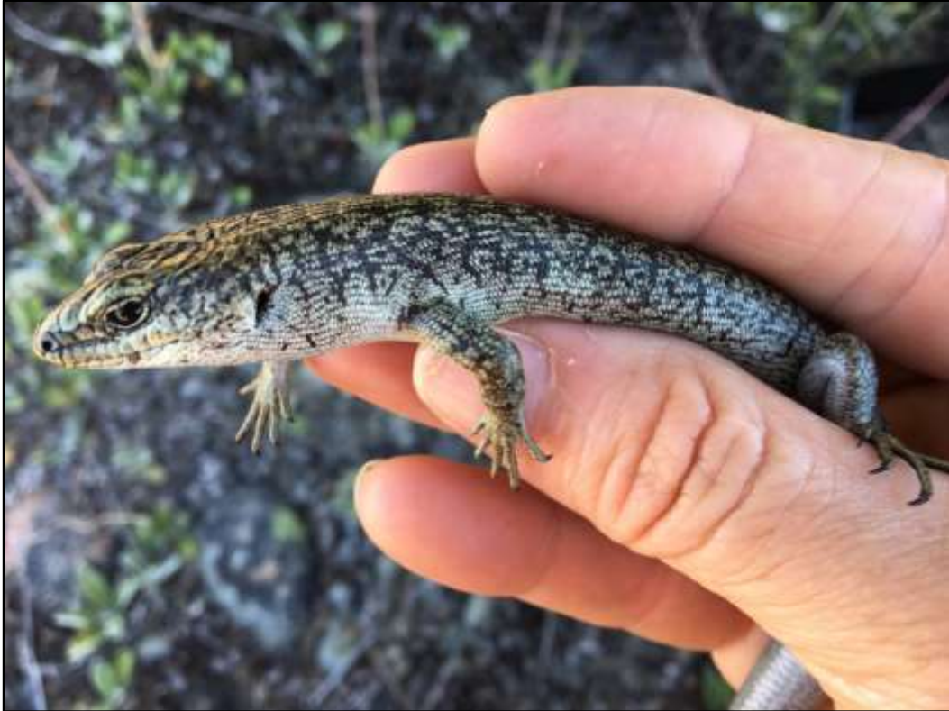
Figure 6. The threatened – Nationally Vulnerable Scree skink, Oligosoma waimatense from the degraded pebble-fields of Tekapo Flats, Simons Pass Dryland Reserve.