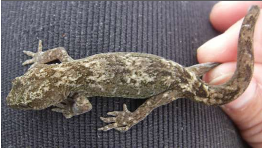
Figure 3. The not threatened Southern Alps gecko. This species was very common all over the Dryland Reserve, but confined to rocky habitat including but not only, rock out-cropping.

the Simons Pass pastoral lease, but was not found over 2012-2013 by Dr Keesing (although he attributed one or more of the “escaped” skinks to this species). Weather during this survey may have been too hot to encounter the Canterbury grass skink that relies on some moisture within its habitat, to survive (e.g. Figure 7). As noted above in Section 2, both the Southern Alps geckos and the McCann’s skink were confirmed to be very common over the district and both species are both numerically and geographically strong over the South Island, hence their ‘not threatened’ classification (Hitchmough et al. 2015).