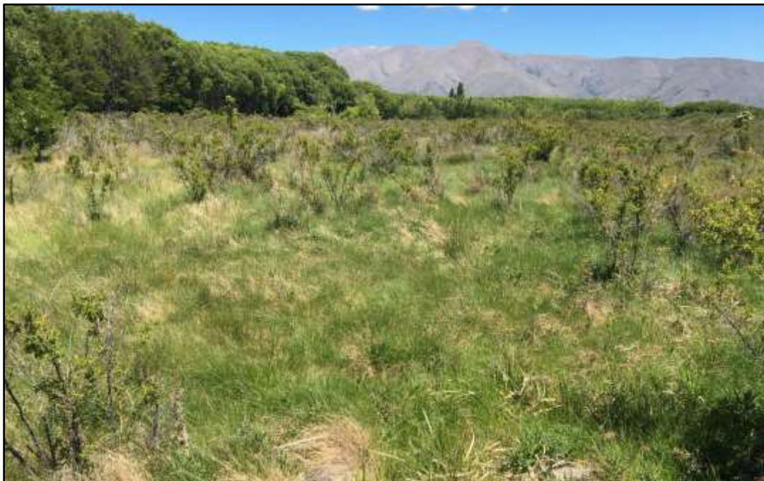
Figure 7. Lush grass in the Tekapo Flats, near the Tekapo River, that was deemed suitable for the Canterbury grass skink; none were found in a 20-minute search at midday, November 22 nd .