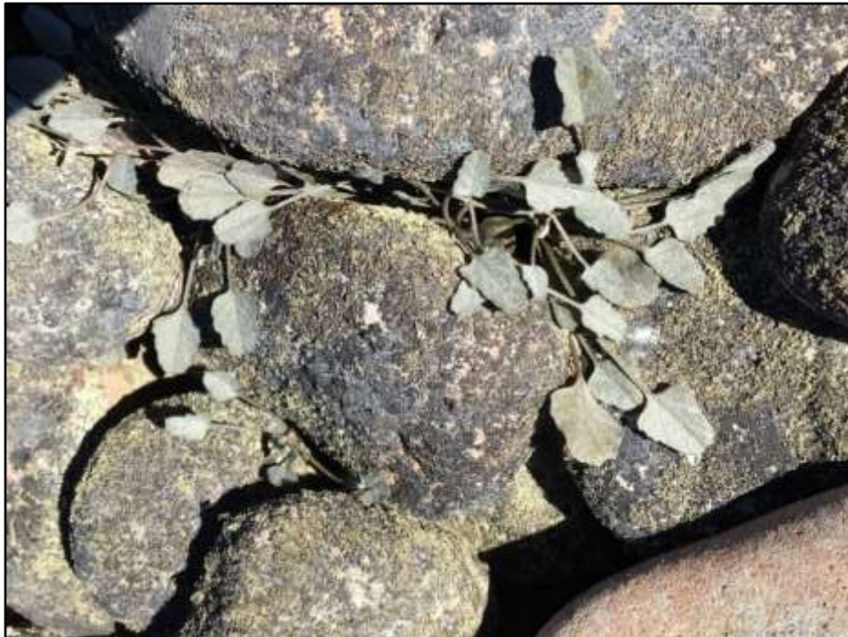
Figure 12. Convolvulus verecundus (At Risk-Declining) found at two locations within the Dryland Reserve at Easting 440089.87 Northing 5094171.13; and Easting 435630.53 and Northing 5101970.06.