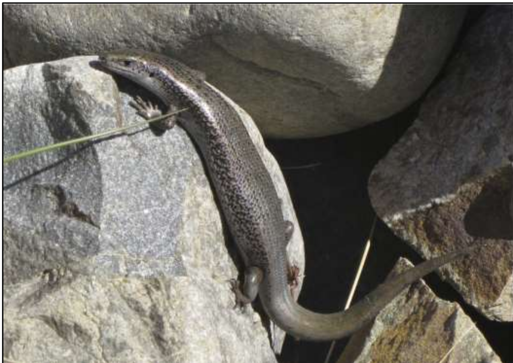
Figure 5. The threatened – Nationally Vulnerable MacKenzie Basin skink Oligosoma prasinum , (holotype) from Edwards Stream.