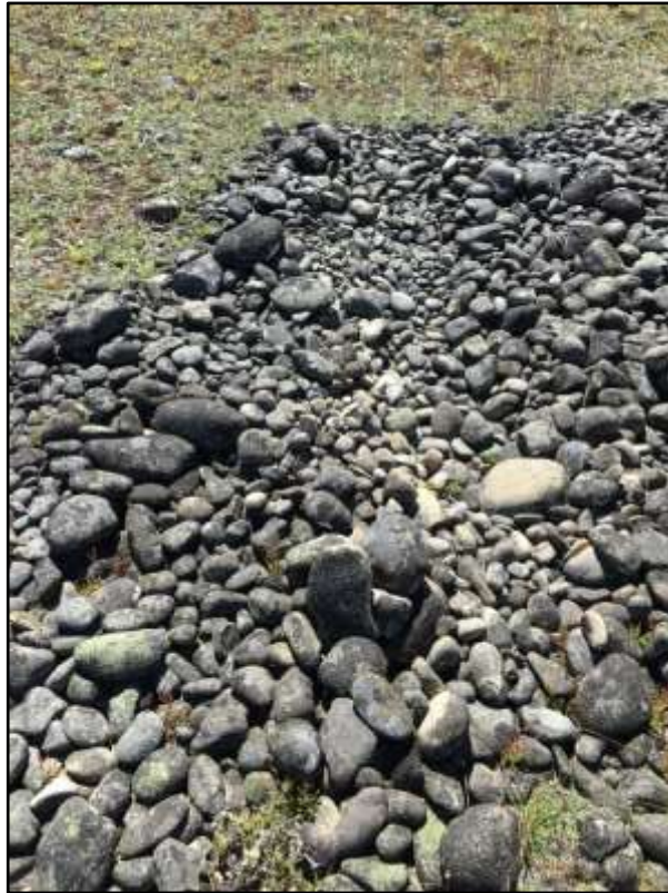
Figure 11. Tracks made by vehicles were observed at more than one location over scree skink habitat in the Tekapo Flats management unit.