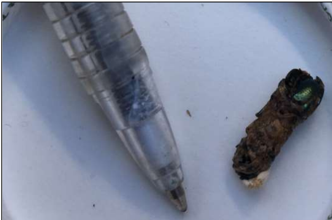
Figure 2. Large scat (c. 2 cm) of a MacKenzie Basin skink found in the Pukaki Flats management unit.

Searches for MacKenzie Basin skinks and scree skinks involved scanning c. 10m ahead, along rocky habitat with binoculars, for lizards active at the surface. If no lizards were located, the habitat was walked looking for large scats. Skinks tend to defecate whilst basking at the surface of rock talus, pebble fields and scree. The high temperatures experienced during the survey and the lack of rain leading up to it meant large lizard scats were very obvious at sites where spotted and scree skinks resided. The scats of adults of these two species are typically 3-4 times the size of McCann's skink (Figure 2). Once a scat was located, extra time was spent at the site to verify the presence of either a scree skink or MacKenzie Basin skink. MacKenzie Basin skinks, in particular, were very shy and required patience to definitively verify their presence; MacKenzie Basin skinks were without exception located in scree or talus partially shaded by vegetation – both exotic vegetation (briar, wilding conifers) and native vegetation ( Coprosma spp.), appeared equally utilised by MacKenzie Basin skinks for shade.