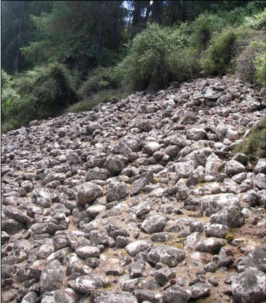
Figure 10. The effects of wilding conifers on lizard habitat in the Pukaki Flats management area; crevices are shaded, clogged and plants can display a 'loose' growth habit.