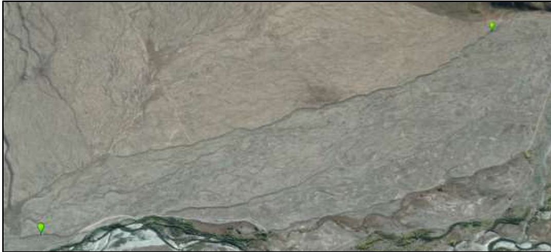
Figure 9. Google Earth image showing the extensive potential habitat for scree skinks in the Tekapo Flats management unit. Scree skinks were found very easily at the two locations searched (green markers, but large areas of habitat remain unsearched, indicated by the darker shaded roughly linear features above (SW-NE aligned), which show the position of rock pebble fields, talus and terraces. Both scree skink populations were found associated with flat/moderately sloped pebble fields.