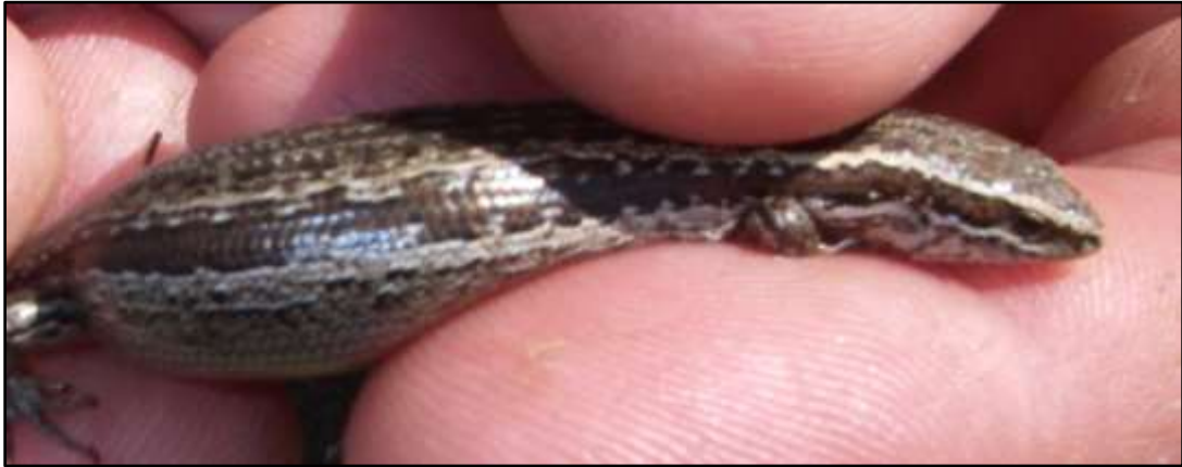
Figure 4. The not threatened McCann's skink, Oligosoma maccanni . This species was very common over the Dryland Reserve in and around rocky habitat and was commonly found with the Southern Alps gecko.

indiscriminately. Adult survival is the key to persistence of large-bodied skinks; intermittent recruitment failure/predation of naïve youngsters can be overcome in a long-lived species by high adult survival; adults have many years to contribute to the population meaning predation of juveniles is less 'critical' to persistence (see Section 7).