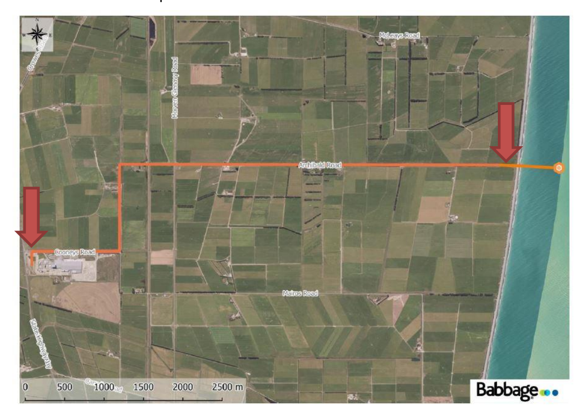
Figure 1: subject area for this report, between red arrows.

considered under separate consents and the detailed assessment can be found in the coastal report.